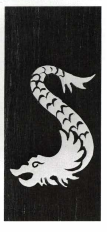
Very fragile and brittle, pearl must be sawn with a studied technique and special care. Left, with jeweler's saw and bird's mouth (the V-notched board clamped to his bench), Newman cuts a mythical sea beast from a mother-of-pearl chip. Top right, Dremel equipped with a tiny end mill routs the recess for the pearl inlay. It must fit easily, but with no gaps. Center, Newman uses an engraver's block to hold the stock when incising detail into the pearl. Engraver's blocks are necessary for good results, since engraving requires moving the work into the tool rather than the other way around, as is the case with carving wood. Engraved gouges filled with epoxy/aniline dye mixture delineate details and add depth to the finished dolphin (about twice actual size), right. Newman used black dye, but other colors would work as well.

a V-notch cut in one end) to his bench. With jeweler's saw in hand, handle up, teeth down, he proceeded to cut around the shape of the beast, using a #3 jeweler's blade (photo, above left). Sometimes moving the pearl into the blade and sometimes moving the blade into the pearl, his easy sawing rhythm kept the blade from binding, which, had it occurred, would have fractured the pearl. Rhythm, he told me, is especially important when sawing tight curves, because interrupting the up-and-down motion can snag the blade, chip the pearl and ruin the whole job.